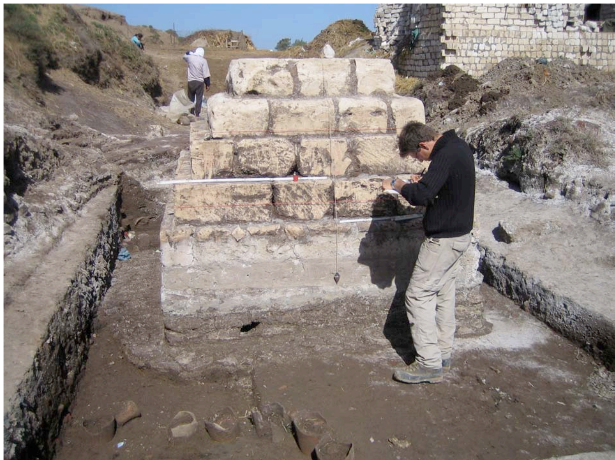
Fig. 2: Kom el Giza. Area 1. Documentation and excavation at the stepped monument