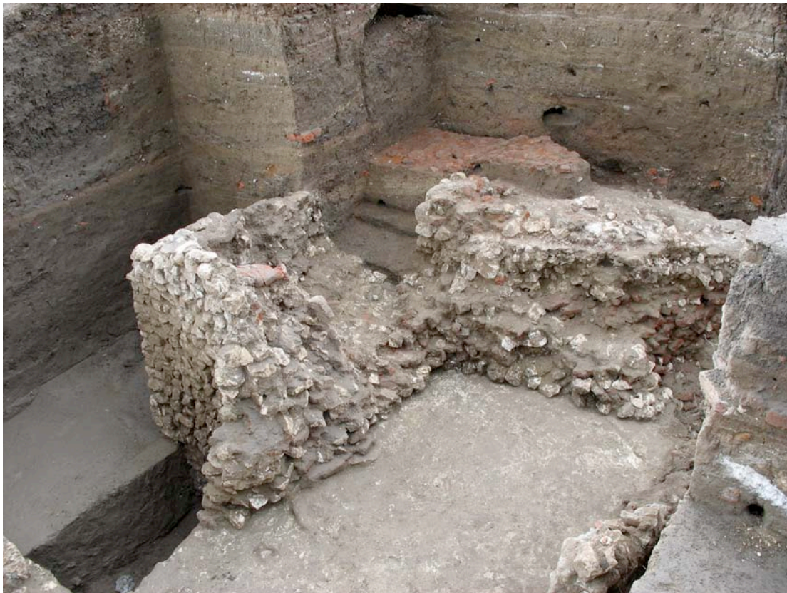
Fig. 8: Kom el Hamam. Area 14, caementicium foundation