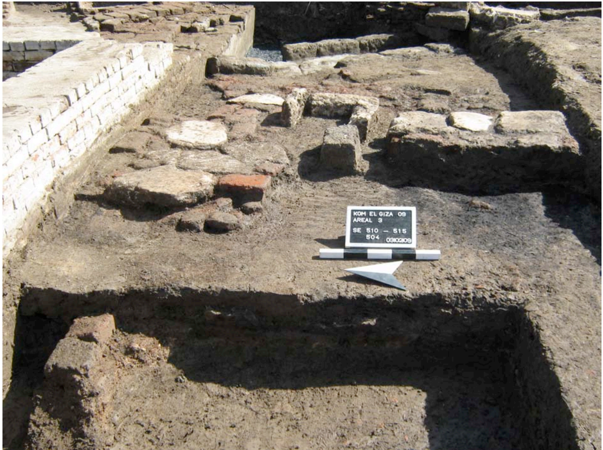
Fig. 5: Kom el Giza. Area 3, excavations south of round bath