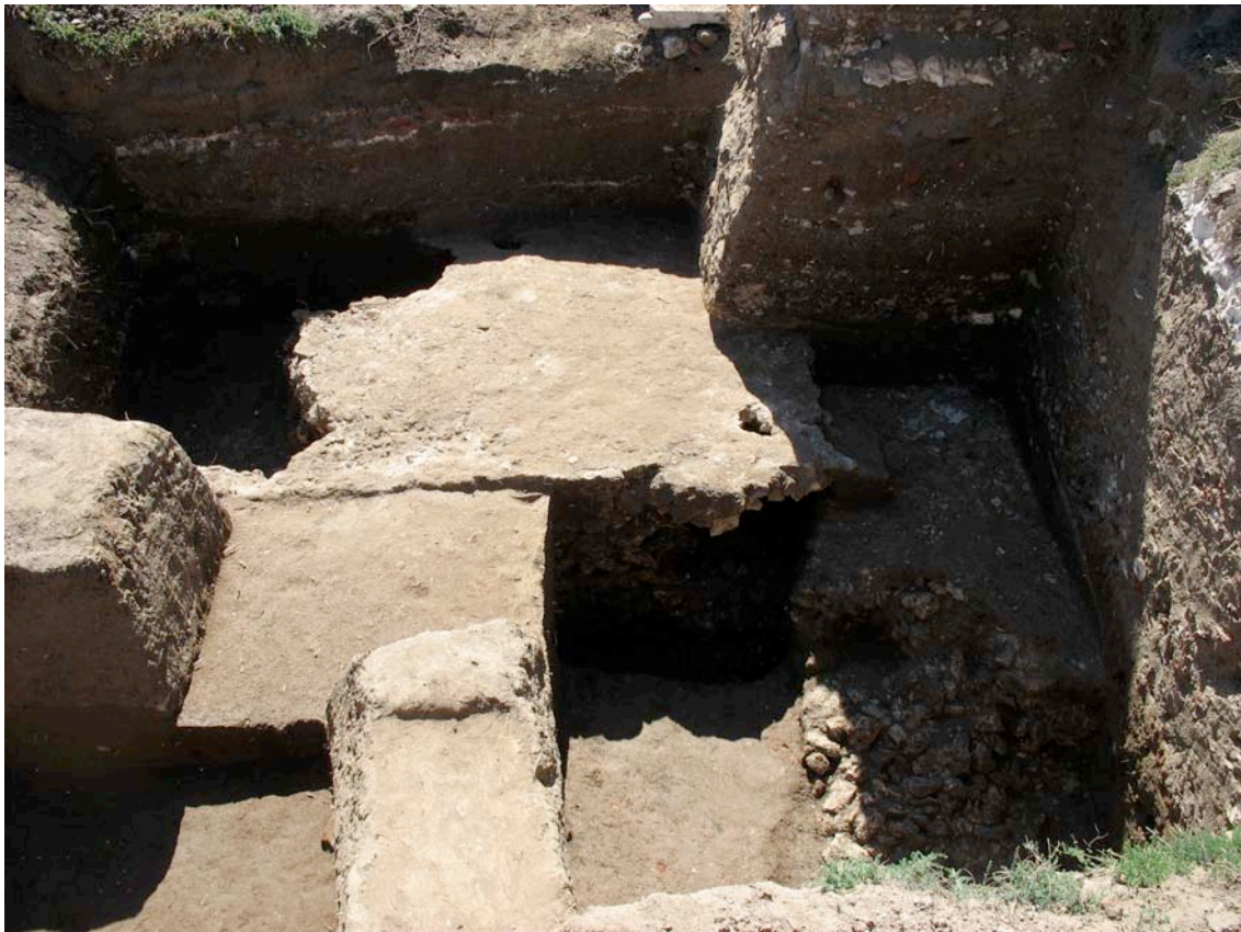
Fig. 7: Kom el Hamam. Area 10, caementicium foundation