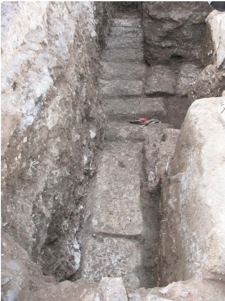
Fig. 4: Kom el Giza. Area 2, wall structure below basins