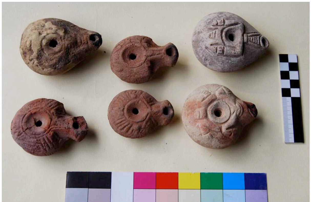
Fig. 10: Lamps