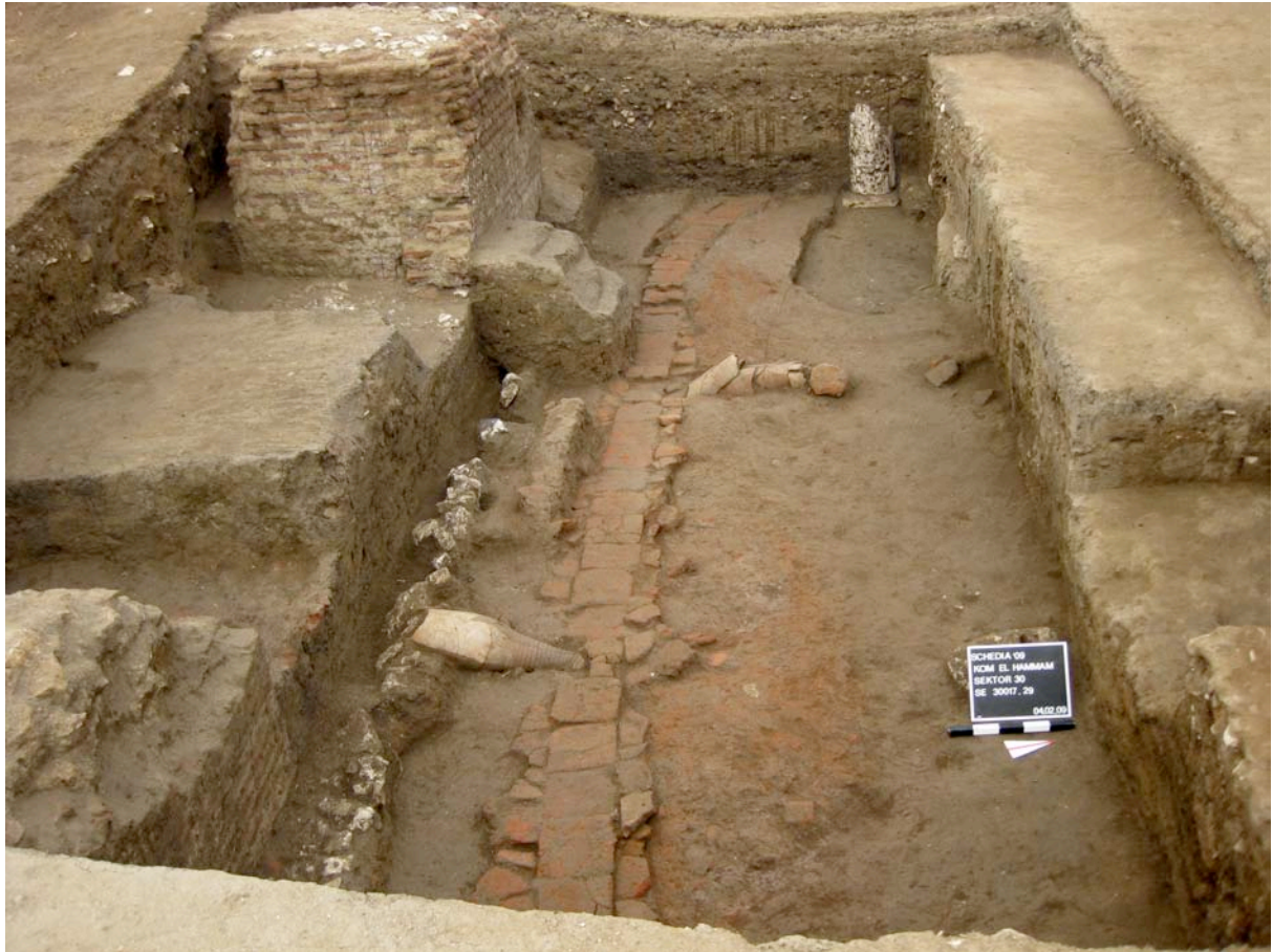
Fig. 9: Kom el Hamam. Area 30, northern façade of the pillar building