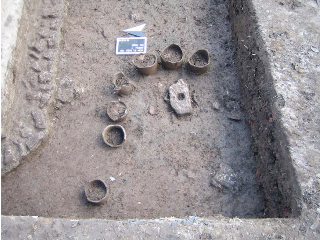
Fig. 3: Kom el Giza. Area 1, stepped monument with amphorae