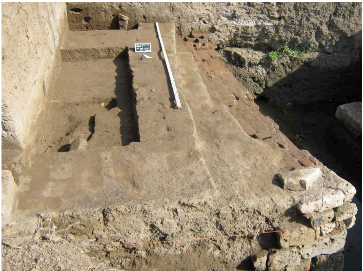
Fig. 6: Kom el Giza. Area 7, house with mud brick walls